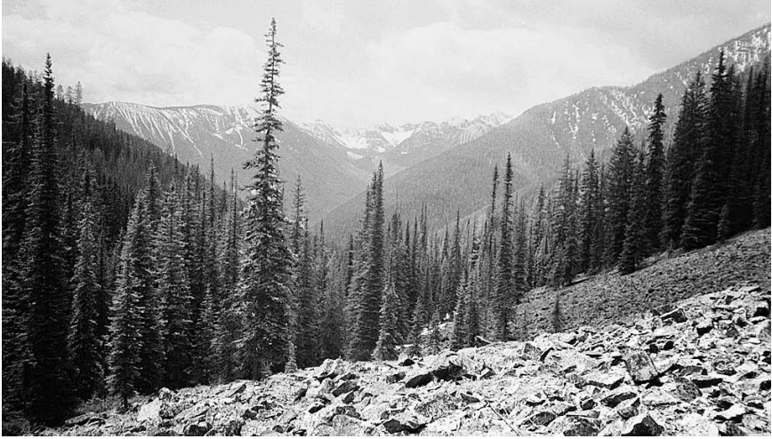
Talus slope along upper Alki Creek looking west down St. Mary River.

Alki Creek is one of the few unlogged valleys in this district and the trail winds through this precious lodgepole pine forest habitat, making a pleasant hike for a hot day. Some large lodgepole pine trees have managed to escape the frequent fires that have swept through this unlogged valley, and their branches join the rest of the forest canopy in providing a cooling shade. The trail passes by the two pre-1900's mining camps mentioned above and leads up toward subalpine lakes on its way to Murphy Pass. Pyramid Mountain, 2655 m (8711 ft.), is west of the pass. The trail climbs steadily along Alki Creek where there are some very slippery log bridges to cross.